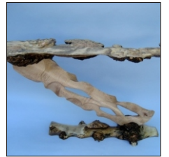
2 Griffins Fine Furniture