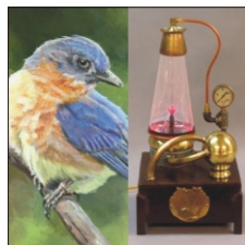
Kidera Designs Paintings, Metal Sculptures