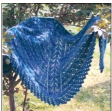
Kiparoo Farm Fiber, Woodenware