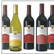
Sugarloaf Mountain Vineyard & Winery