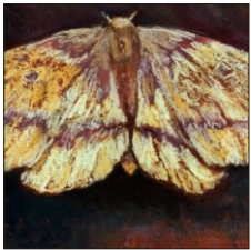
Sugarloaf Studio Paintings, Prints, Drawings

Countryside Artisans' 2013 Fall Studio Tour Friday, Saturday, Sunday October 11, 12 and 13 Fri. and Sat. - 10:00 - 5:00 Sunday 12-5