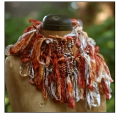
Dancing Leaf Farm Jewelry, Fiber, Art