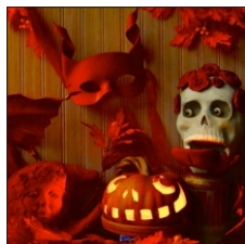
Niswander Ceramics Sculpture & Art Pottery