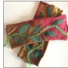
Tiewyan Farm Art for Home and Body