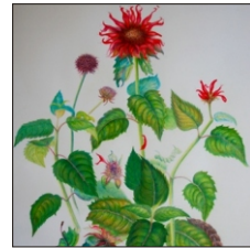
Morningstar Studio Paintings, Pastels, Drawings