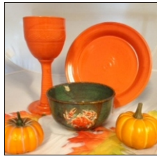
Something Earthy Pottery & Gift Gallery