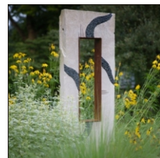
Alden Farms Stone Garden Sculpture

Come out for autumn colors! Meet and talk with the artisans as they open their studios to offer an array of handcrafted items for sale.