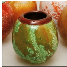
Art of Fire Hand-blown Glass